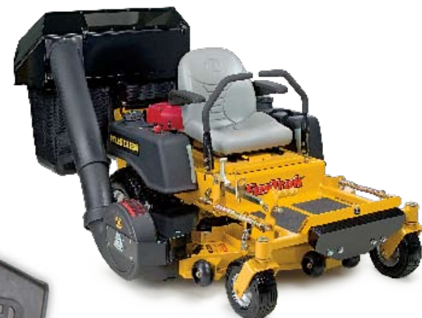
Optional catchers help the FasTrak maintain a professional-quality lawn.