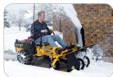
The tough, productive snowblower clears a 48" path.